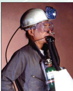
The EBA 6.5 can be donned in 15 seconds or less.

Since introducing the EBA 6.5, Ocenco Inc. has sold more emergency escape breathing apparatus to the worlds mining industry than all other manufacturers combined.