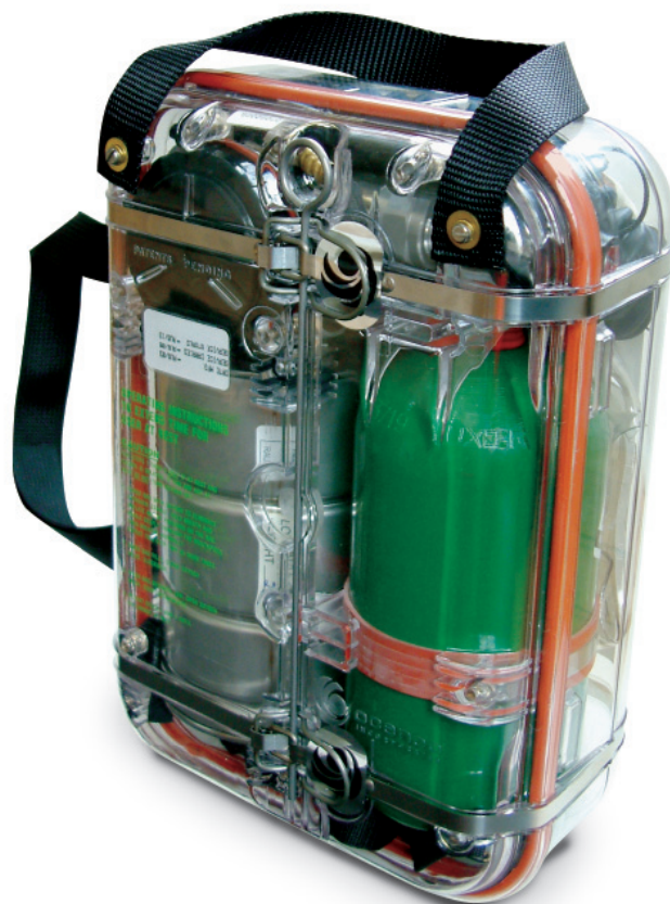
The EBA 6.5, in its clear, polycarbonate case, is durable and easy to inspect.

Easy to inspect – simple visual inspection confirms that unit is ready to use.